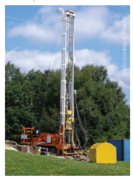
Drilling rig at a similar scheme

The pilot scheme would require a temporary working site of about 20m x 30m. During construction this is likely to contain: